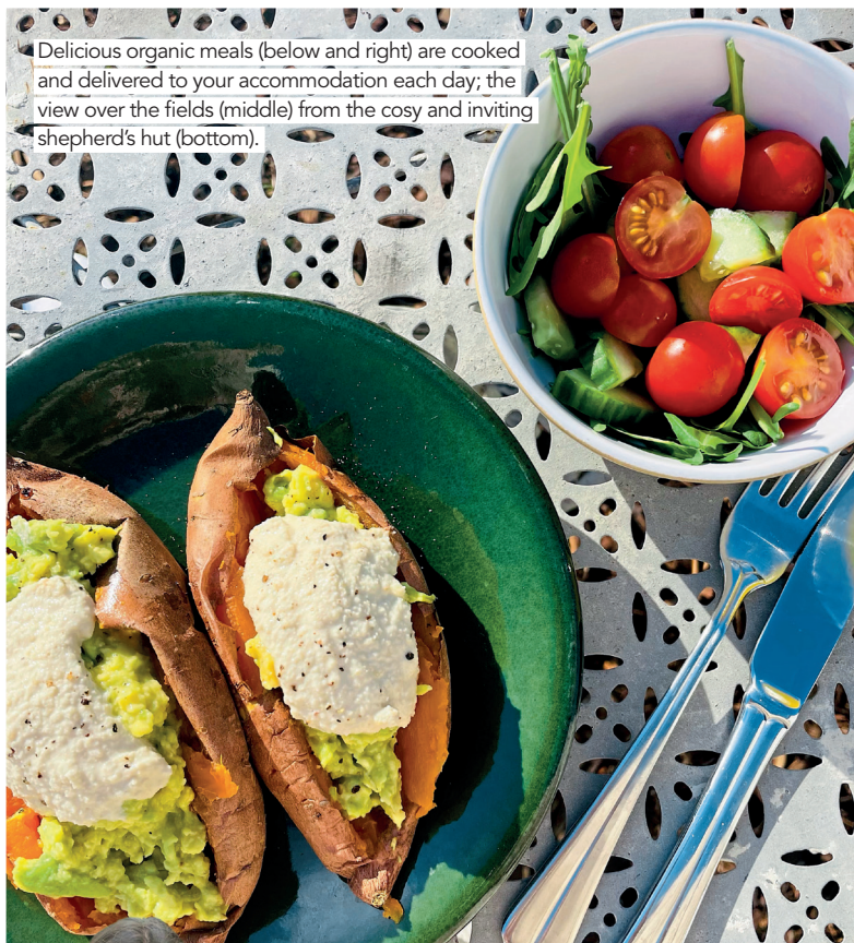
Delicious organic meals (below and right) are cooked and delivered to your accommodation each day; the view over the fields (middle) from the cosy and inviting shepherd's hut (bottom).